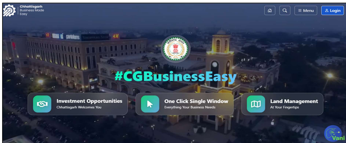
Figure 1: Homepage Screen

Enter the website URL ( https://invest.cg.gov.in ) in the browser and the page navigates to the landing page of the One Click –Single Window System.