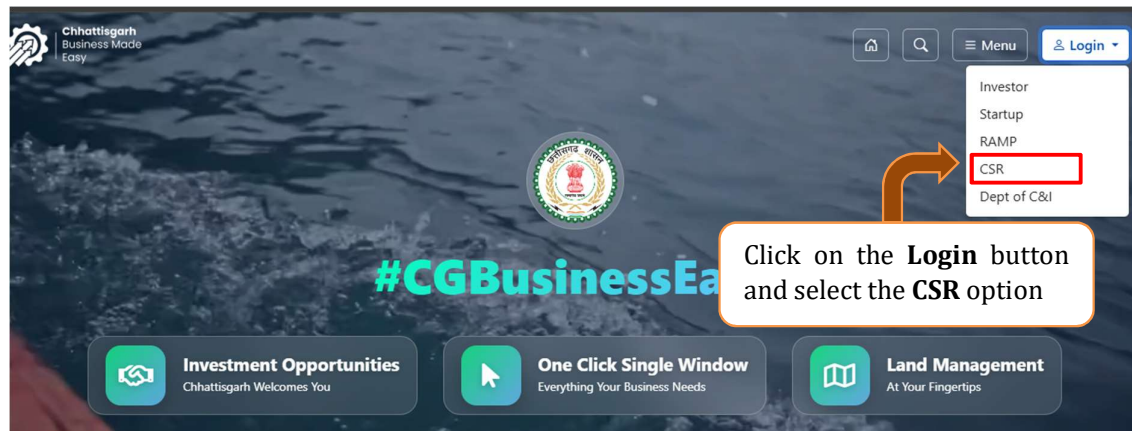
Figure 4.1: CSR Login

To access CSR functionalities, users must first register on the portal. After successful registration, users can log in using their credentials.